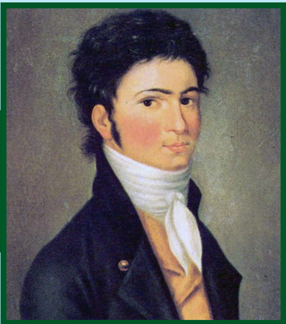
Ludwig van Beethoven

character, according to a long-held tradition in theme and variations form. The tenth variation is a crowd-pleasing romp, marked Presto , and then follows the Allegretto to conclude the Kakadu Variations in grand fashion.