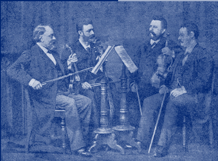
The Joachim Quartet, including cellist Robert Hausmann

own idiom, in which modern chromatic harmonies are melded with a gradually evolving approach to tonal form reminiscent of Beethoven and Viennese Classicism. The First Cello Sonata was part of this series which also included the two string sextets, the piano quintet and two quartets, the horn trio, and several solo piano works. Significantly, these pieces are for chamber ensembles at a time when Liszt and his followers were propounding the supremacy of orchestral music; they were also examples of absolute music—music without programs—whereas Liszt busily advocated of the necessity that new music have reference to literature. In this way, these chamber works are again more like those of Beethoven: while their musical content can have tremendous personal meaning for the composer, their formal logic is not shaped by an extramusical narrative, such as the popular Faust legend or another literary motivator as was increasingly the case in the wake of Liszt's symphonic poems.