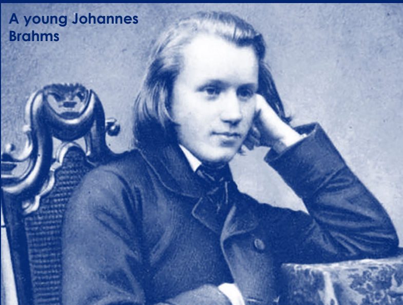
A young Johannes Brahms